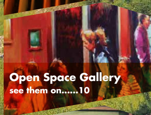
Open Space Gallery see them on.....10