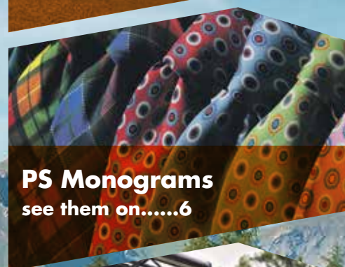
PS Monograms see them on.....6