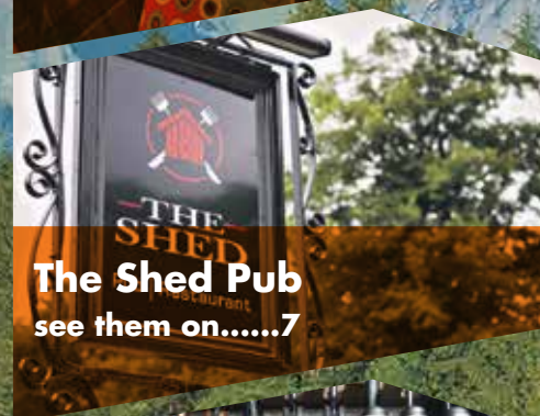
The Shed Pub see them on.....7