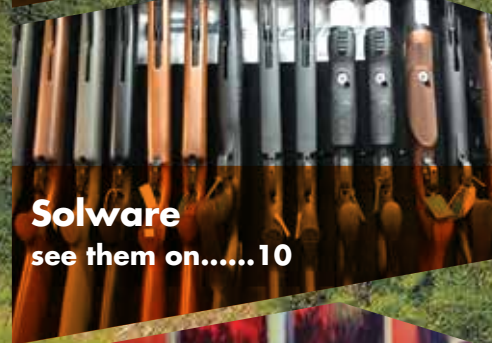
Solware see them on.....10