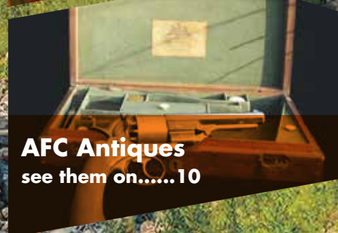
AFC Antiques see them on.....10