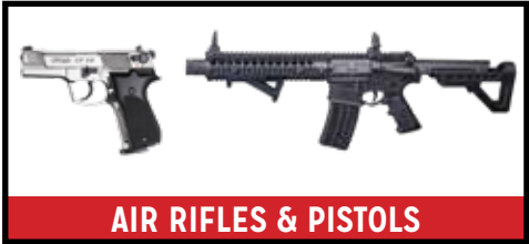
AIR RIFLES & PISTOLS