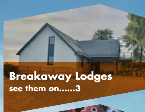
Breakaway Lodges see them on.....3

The perfect location to meet, eat & drink with friends and family – See more on page 7